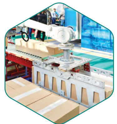
Palletizing and Depalletizing