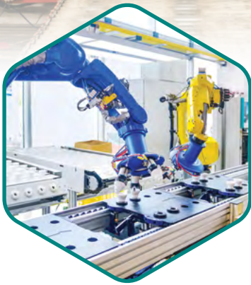
Pick and Place

Our innovation is the linchpin of our customer's sustained competitiveness and profitability. Taknek harnesses our extensive expertise in robotic integration to conquer the most intricate production challenges using state-of-the-art automation technology.